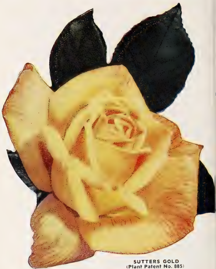
SUTTERS GOLD (Plant Patent No. 885)